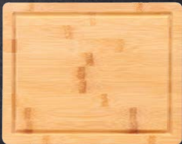
STONELINE® bamboo cutting board

For the perfect cutting experience, choose the right cutting board from our range.