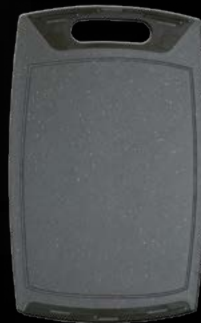
STONELINE® 2-piece cutting board set