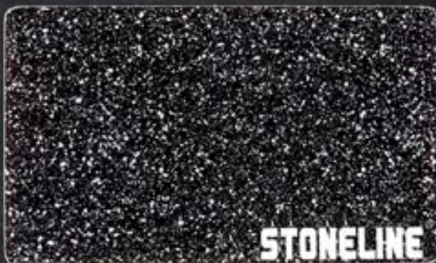
STONELINE® 4-piece glass cutting board set